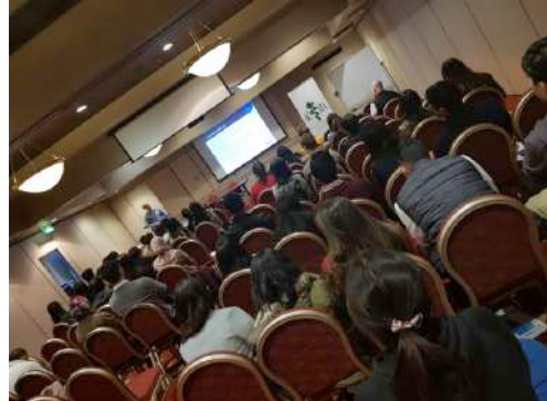
ACMA Careers Day 1

specialists provided CV feedback to all our attendees prior to the event. For many, constructing their first CVs was not easy!