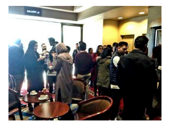
ACMA Careers Day 2