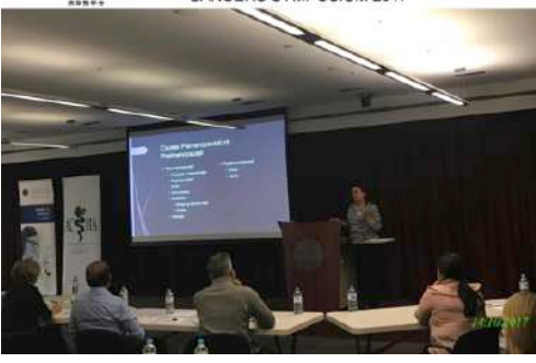
ACMA GYNAECOLOGICAL AND COLORECTAL CANCERS SYMPOSIUM 2017