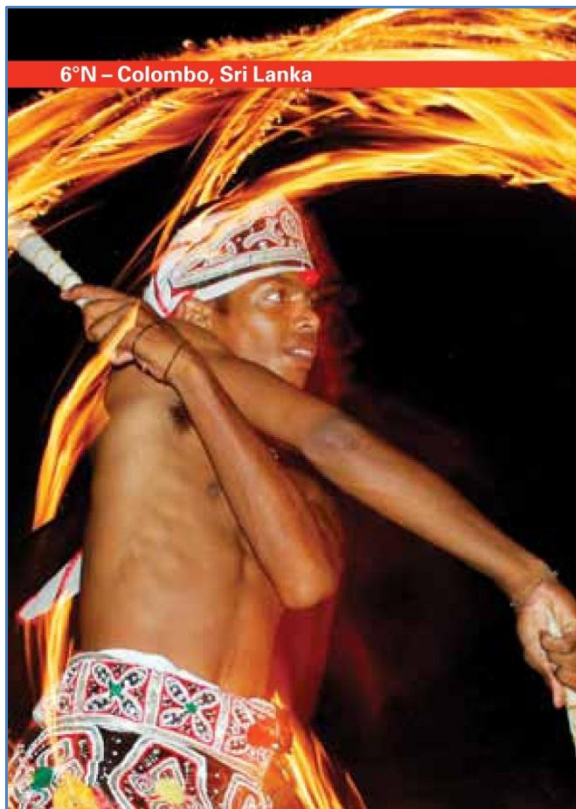
6°N – Colombo, Sri Lanka