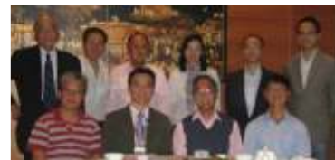
ACCMA Delegates 2010