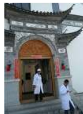
Peggy Health Centre