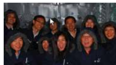
ACCMA Delegates at Minus 5° Bar