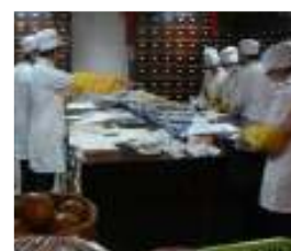
Herbal Medicine being prepared at the Hospital pharmacy